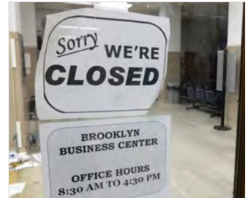
Brooklyn Business Center that's closed for renovation at 210 Joralemon...